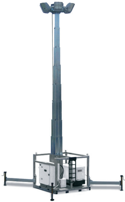
Powerful Metal Halide Lights