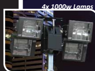
4x 1000w Lamps

In addition to the PR4000, the PR8000 and PR2000 models are available for sale and rental Australia wide. The PR8000 is designed specifically for mining and maximum light output applications, producing up to 24,500m 2 of light, utilising 4x2000w Metal Halide lights mounted to a fully hydraulic vertical mast. Hydraulic stabiliser legs and light tilt capabilities are also standard features.