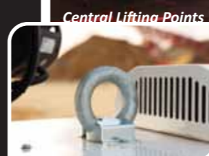
Central Lifting Points