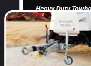
Heavy Duty Towbar