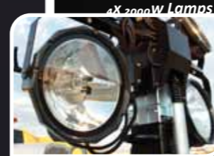
4x 2000W Lamps

In addition to the PR8000, PR Power supply a wide range of mobile lighting towers for sale and rental to meet the needs of various applications from mining, construction, civil works, industrial, road works and events.