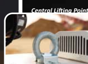
Central Lifting Points