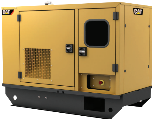
Enclosure pictured may include optional accessories