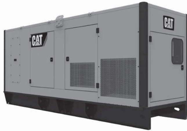
Picture shown may not reflect actual package.